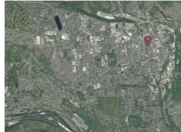
Aerial view of Halifax

A map shows what there is in an area. It needs a title so that we know the place it is showing us. They have a key so that we can understand what each symbol means.