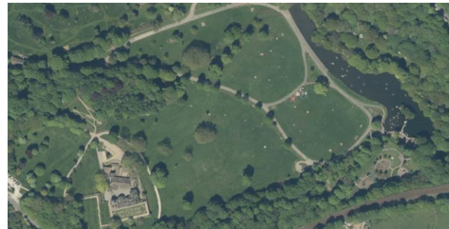
Aerial view of Shibden Park