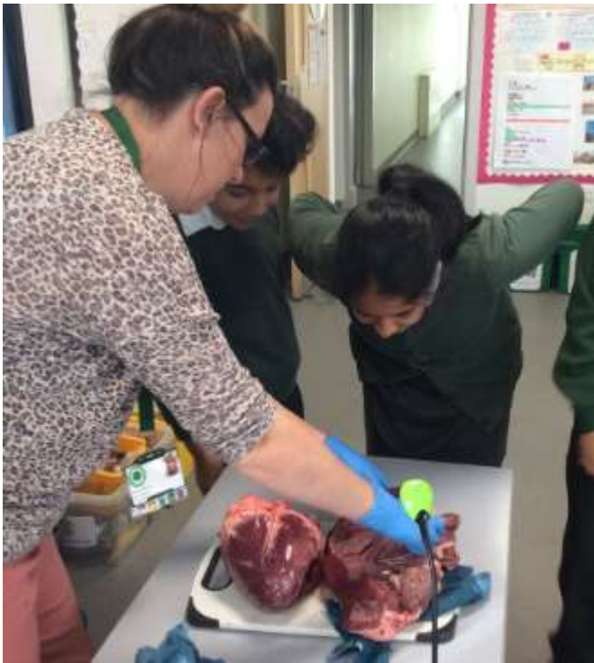
Year 6 dissected an ox's heart to see the many blood vessels and the thickness of the cardiac muscles.