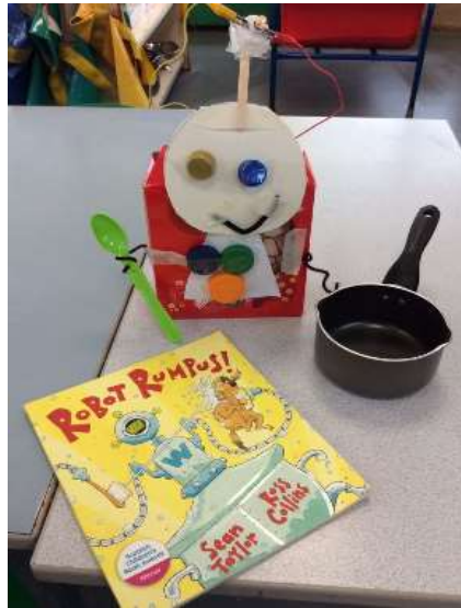
Reception children made their own robots using junk model and included a simple circuit so the eyes lit up.