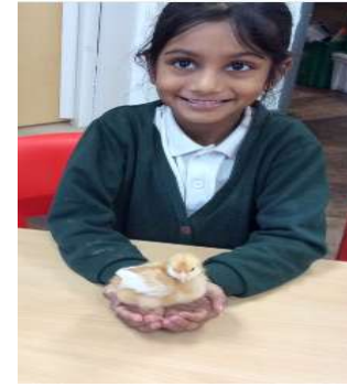
Year 2 had an amazing experience where the eggs came in and they watched them grow, held them and looked after them as part of their science unit 'animals including humans'