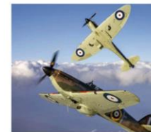
The Battle of Britain

The Battle of Britain was fought between the RAF and the Luftwaffe. The RAF pilots recorded what had happened during flight in a combat report.