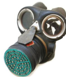
Everyone carried a gas mask with them at all times.

Adolf Hitler was an Austrian-born German politician who was the dictator of Germany from 1933 until 1945.