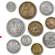
Pounds, shillings and pence (imperial) were the currency used during WWII.