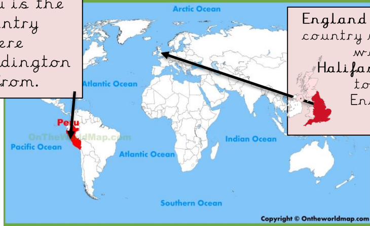
Map of the World

Peru is the country where Paddington is from.