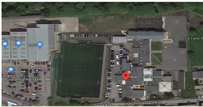
Aerial view of Beech Hill School

Human features are changes to the land made by humans. Roads, shops and houses are human features .