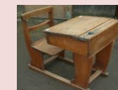
desk and chair